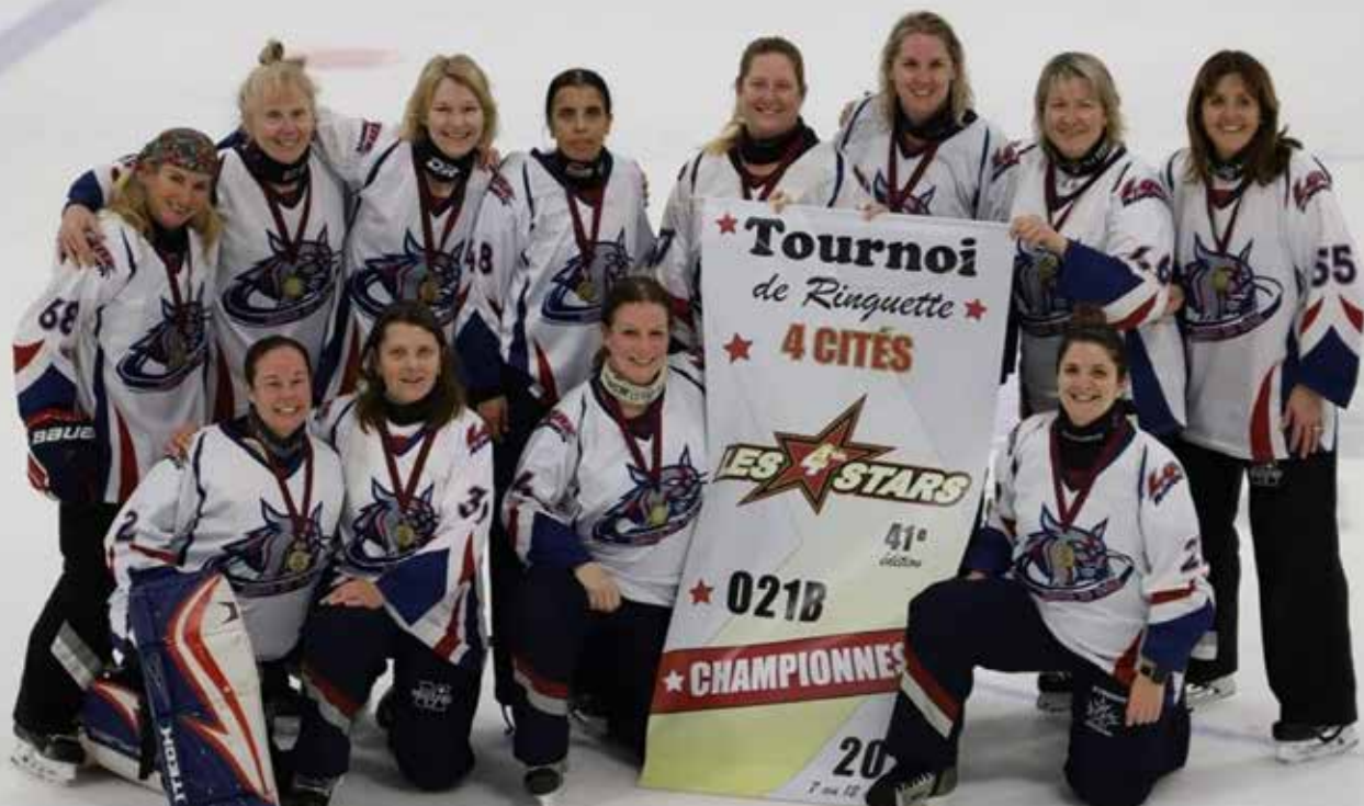
Pierrefonds Inter B champions 4Cités tournament