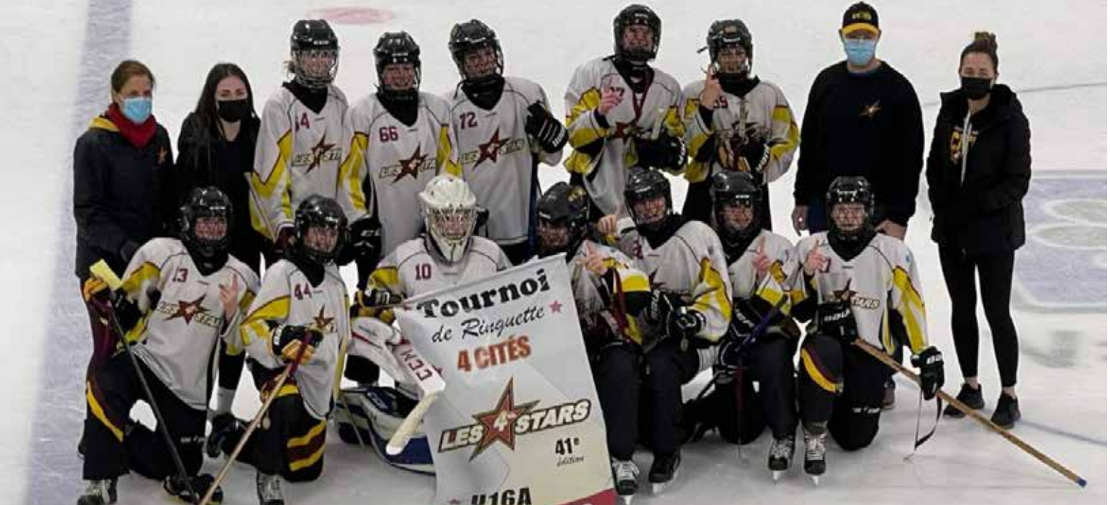
4-Cités Junior A champions 4Cités tournament