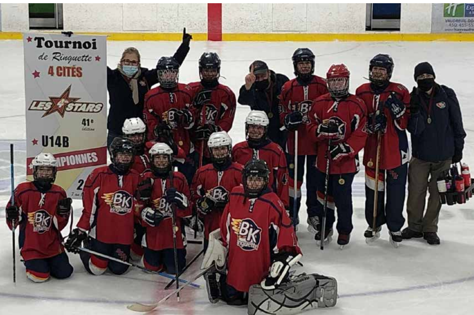
BKRA Benjamine B champions 4Cités tournament