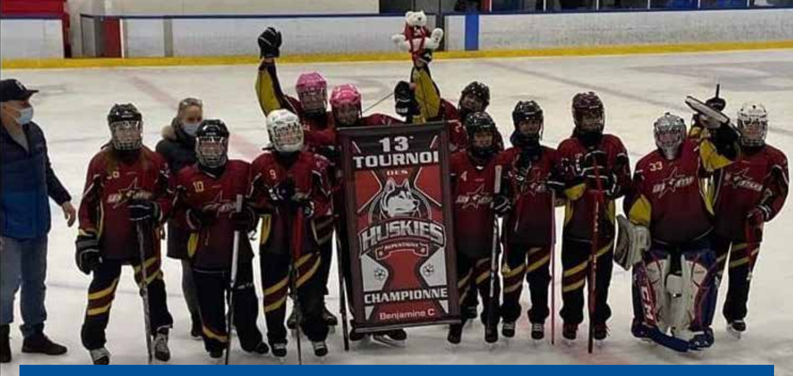
4-Cités Benjamine C champions Repentigny tournament