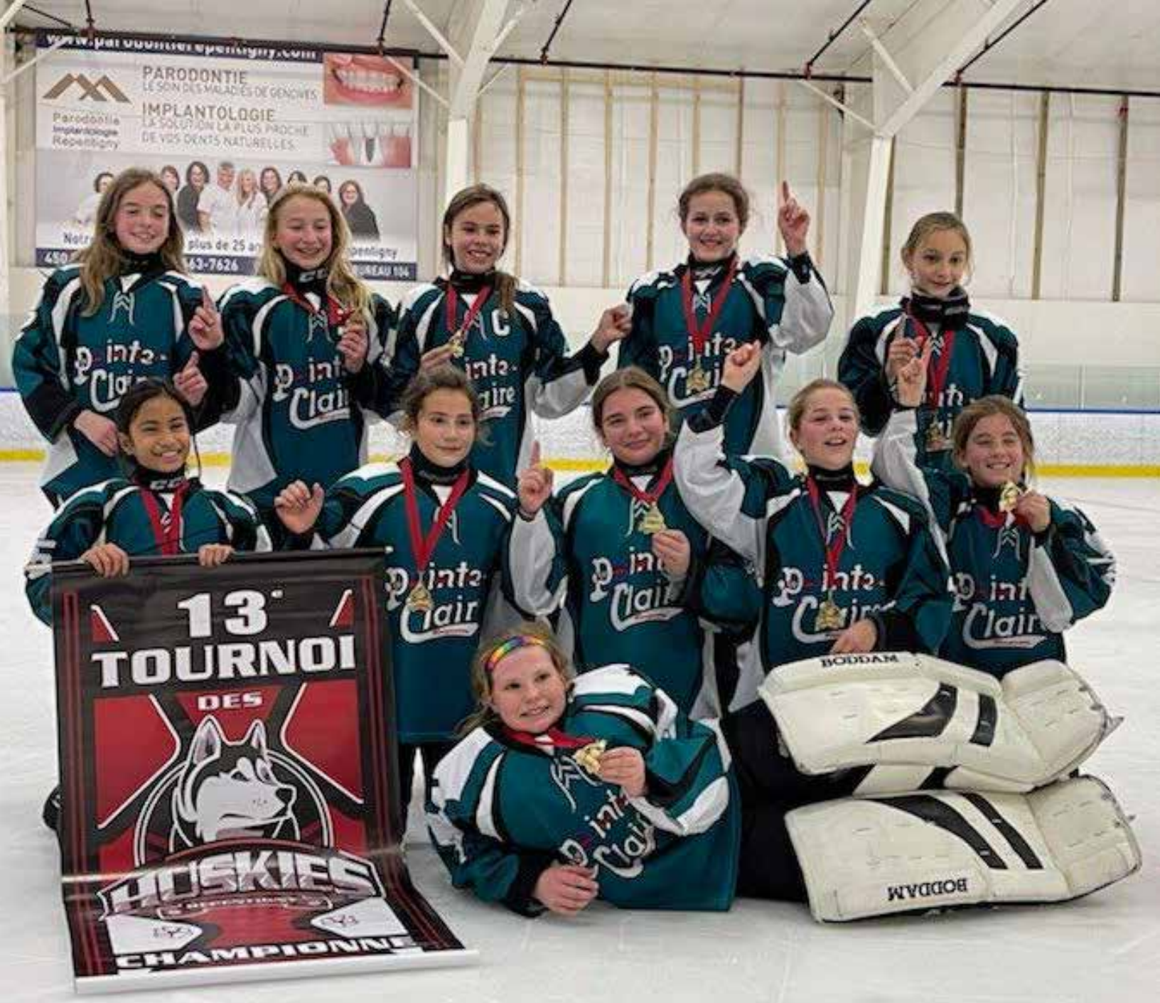
Pointe-Claire Atome A champions Repentigny tournament